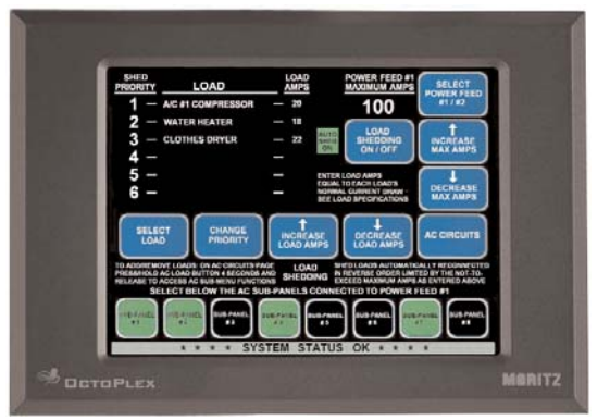
Advanced electronic power control : Octoplex (above) can even manage load shedding on a yacht with two shore power cables.

While all sorts of companies are developing digital switching and distribution products for boats, OctoPlex will serve well to illustrate an overview. For one thing, its ambitious developer, Moritz Aerospace, has seemingly included all possibilities, as hinted at by the system diagram above. The 6.5-inch screen can potentially do more system